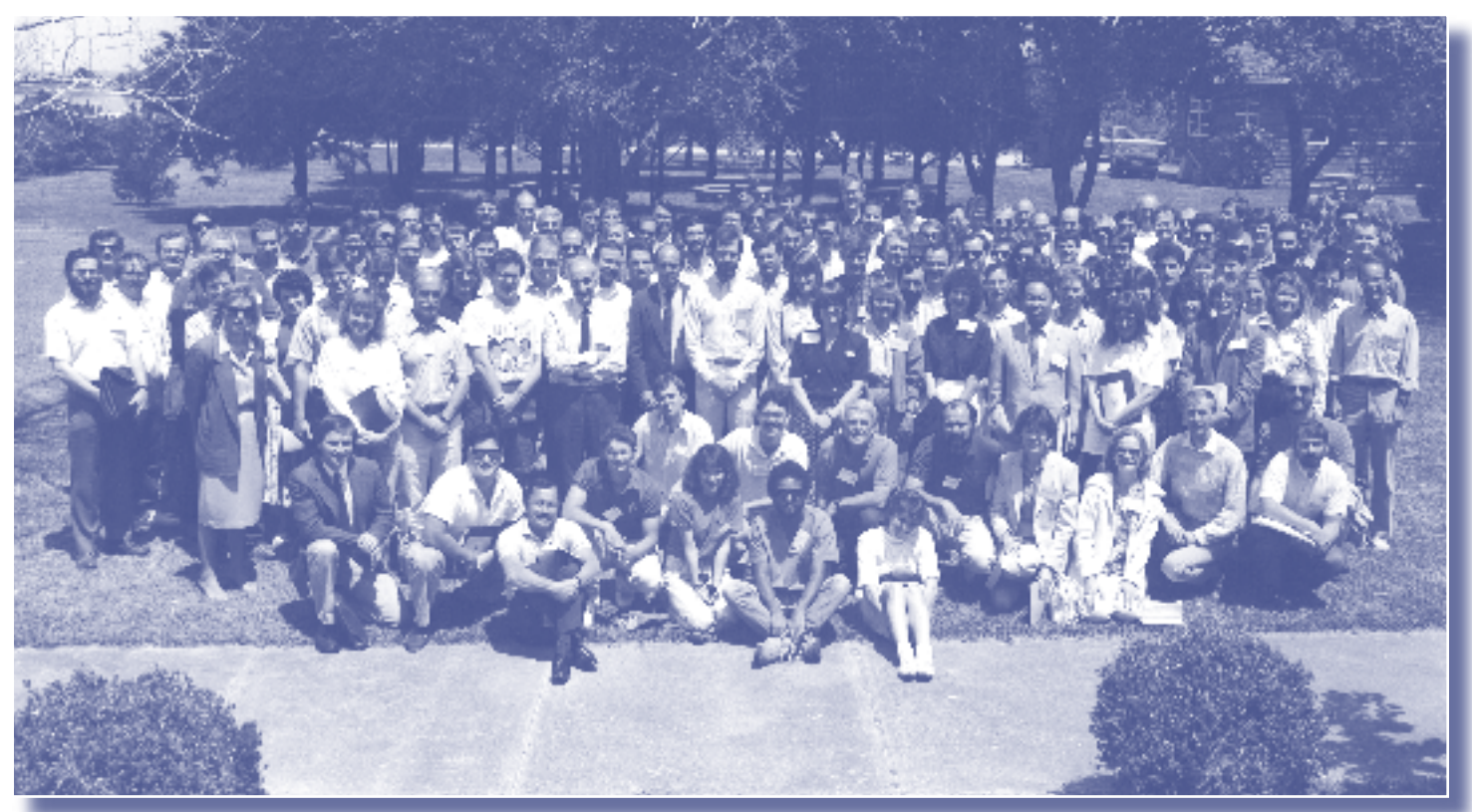
Sure, but which Larval Fish Conference at Beaufort? Old-timers with long memories will recall that Pivers Island twice served as the site of our conference. Which one is this? Do you want a more difficult challenge? How many people pictured here can you identify?