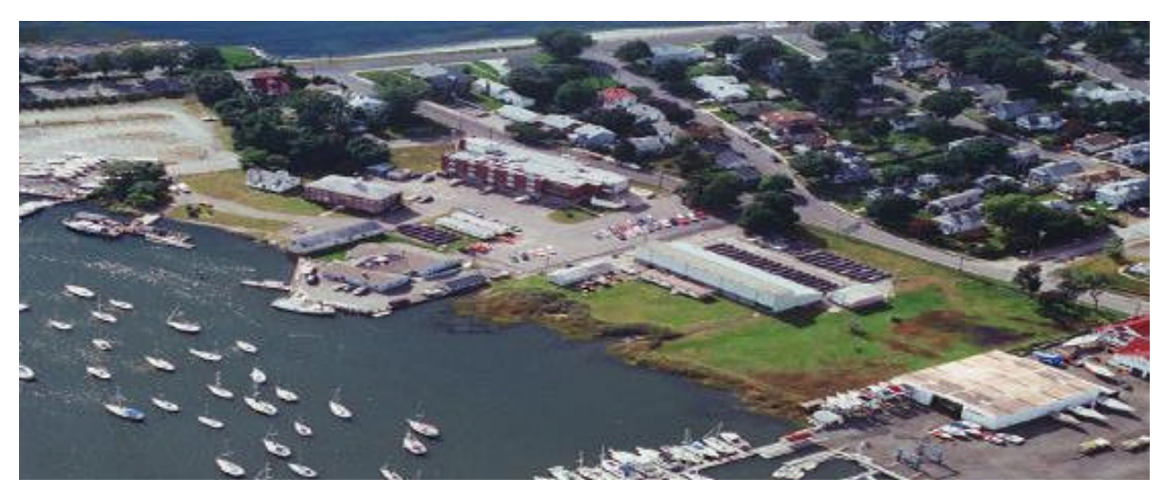
National Marine Fisheries Service's Milford Laboratory in Milford CT. Present research emphasizes aquaculture and habitat-related work. A well-integrated aquaculture program includes studies of the culture of fish and shell-fish to develop methods suitable for commercial use as well as for stock enhancement and restoration

The National Marine Fisheries Service Northeast Fisheries Science Center is sponsoring a Flatfish Biology Workshop to be held December 1-2, 1998 at the Best Western Sovereign Hotel in Mystic, CT. The workshop is the sixth in a series that began in 1986 dealing with Northeastern Atlantic flatfishes. Individuals conducting research on various flatfishes may present their findings to others interested in gaining a better understanding of flatfish biology. Of particular emphasis this year will be research activities related to essential fish habitat for species covered under Fishery Management Plans, including the American plaice, Atlantic halibut, and the witch, yellowtail, summer, winter, and windowpane flounders. The symposium is divided into eight sessions over two days. More than 40 presentations will be delivered. Titles and authors of presentations are available at the Milford Laboratory home page at www.mi.nmfs.gov. Full details of the conference are also available at this site.