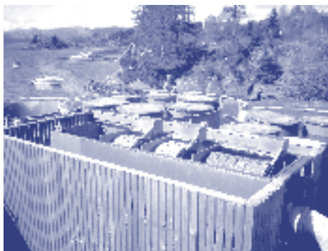
Land-based mesocosm facility at Espeyrend Marine Station.

The research team made use of the land-based mesocosm facility at the Espeyrend Marine Station, Department of Biology, University of Bergen. The CO 2 -perturbation experiment was carried out with four pCO 2 levels (380, 870, 1400 and 4000 µatm) and three replicates for each treatment level. The 2650-L replicate tanks