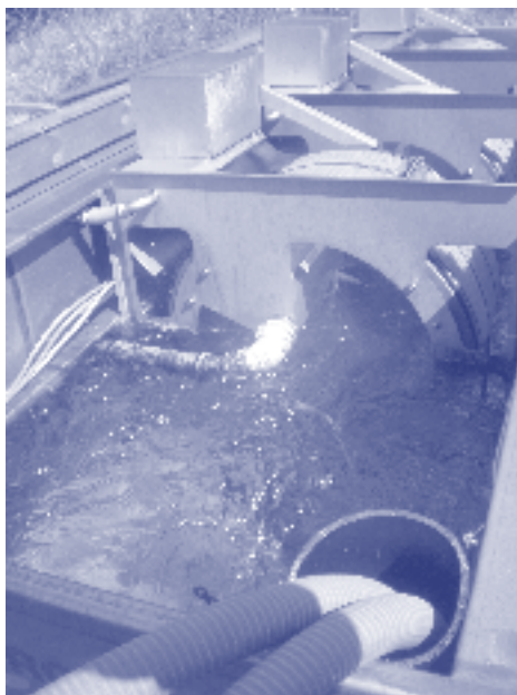
Natural zooplankton is filtered daily using the Hydrotec filter system.

The larvae were sampled twice during the first two weeks and subsequently once a week. To obtain samples throughout the water column, a PVC-pipe sampler was