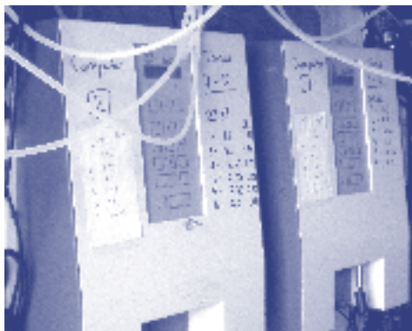
Aquastar IKS computer regulates the amount of CO 2 bubbled into the tanks.

were placed inside two water baths to keep the temperature stable. The targeted pCO 2 levels were achieved by bubbling CO 2 directly into the tanks and regulated by a feedback mechanism from a pH probe in each tank, connected to an Aquastar IKS computer. The Aquastar IKS provided continuous daily pH measurements for all tanks. In addition, daily monitoring with a hand-held WTW pH probe was done to check the pH values of the Aquastar IKS. The WTW pH probe was calibrated