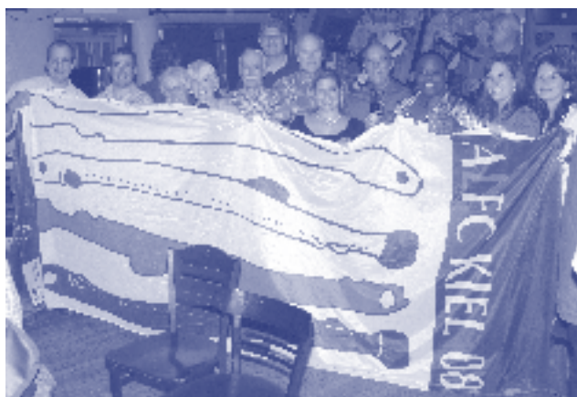
Winners of the auction for the honor to have the LFC flag for the next year are joyous over their prize.