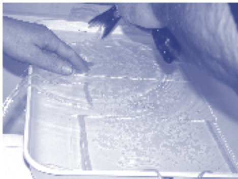
Stripping of eggs from a mature female herring into the glass plates.

Fertilized cod eggs, obtained from the Institute of Marine Research Parisvatnet Field Station, were incubated in mesh-bottomed buckets floating inside each mesocosm tank, allowing water exchange. Adult, ripe herring from Lindåspollene in western Norway were stripped and the eggs spread onto glass plates for fertilization. The plates were suspended in the middle of each mesocosm for egg incubation. Hatched larvae of cod and herring were redistributed between replicate tanks in each treatment level to equalize the number of larvae between tanks. Additionally, control larvae that were not fed were kept in floating buckets inside the tanks in order to monitor the overall condition of the eggs used and to check whether starvation has a synergistic effect with acidification on the larvae. All other larvae were fed with natural zooplankton, filtered over a 24-hour period from the fjord, maintaining a density of 2000 zooplankters per liter.